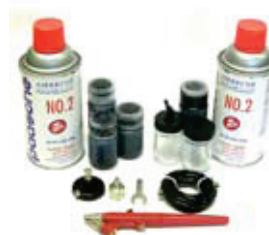
The TLC-100 ThermoChromic Liquid Crystal Kit (above) for heat transfer studies and mapping of temperature fields on components.