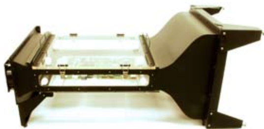
Side view of the BWT-104WA Benchtop Wind Tunnel