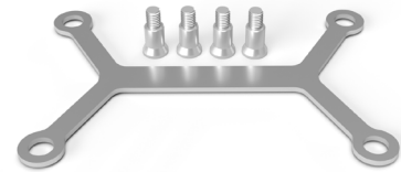
Fig. 1 - Leaf spring with screws for mounting heat sink