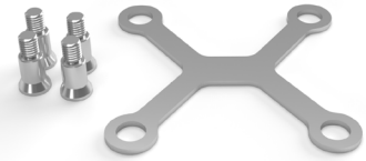
Fig. 1 - Leaf spring with screws for mounting heat sink