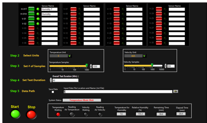
stageVIEW™ software for automated data acquisition and reduction

Its portable design and compact dimensions make it an ideal choice for various applications. The system requires a PC for operation and seamlessly interfaces with the included stageVIEW™ software for intuitive data acquisition and reporting.