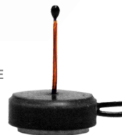
TEMPERATURE & VELOCITY SENSOR