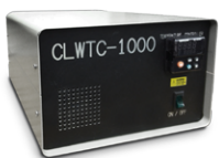
CLWTC-1000™ Wind Tunnel Controller